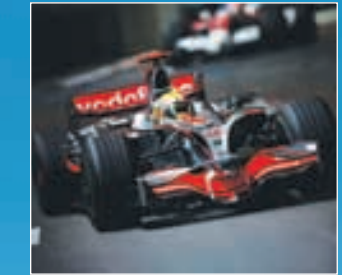
F1 Night Race

At 165 metres, the Singapore Flyer is the world's largest observation wheel offering visitors breathtaking views of the ever changing cityscape.