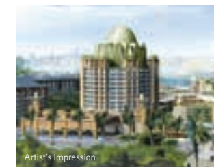
Resorts World Sentosa

Located on the private Keppel Island, Marina at Keppel Bay is where Asia's discerning and privileged live and berth. The Marina features state-of-the-art concrete floating berths for 168 yachts, including megayachts of up to 300 feet.