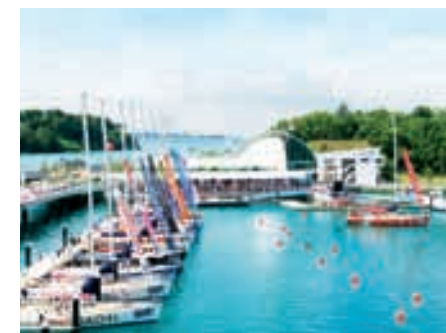
Marina at Keppel Bay

Presenting the very best in urban and waterfront lifestyles, Keppel Bay comprises the completed Caribbean at Keppel Bay (FIABCI Prix d'Excellence 2005 winner), architect laureate Daniel Libeskind's Reflections at Keppel Bay and the exquisite Marina at Keppel Bay.