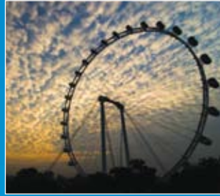
新加坡摩天观景轮

乐园，就在国际都会的中心。海滨花苑包括一座设备先进的温室，展示最具代表性的热带园艺和艺术精华之体现。